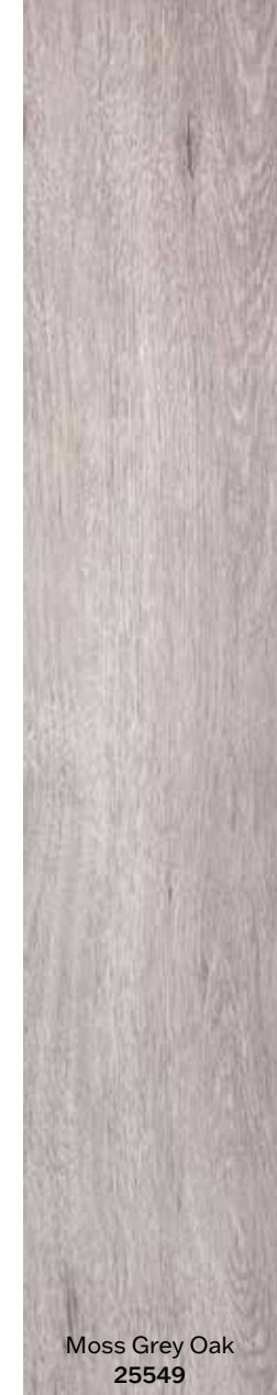
Moss Grey Oak 25549