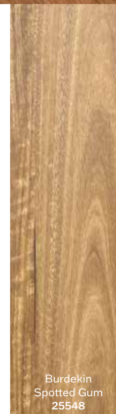
Burdekin Spotted Gum 25548