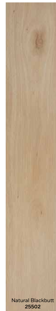
Natural Blackbutt 25502