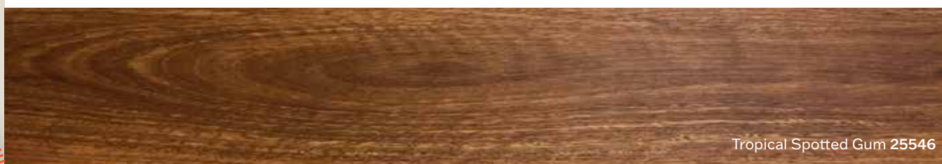
Tropical Spotted Gum 25546