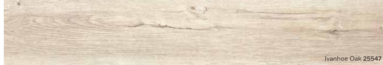
Ivanhoe Oak 25547

It's gorgeous range of designs will make your commercial space or home stand out above rest.