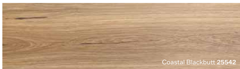
Coastal Blackbutt 25542