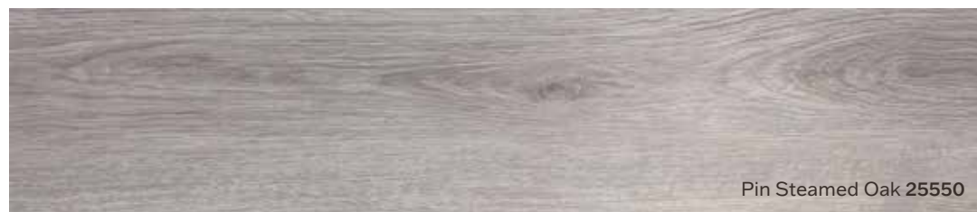
Pin Steamed Oak 25550