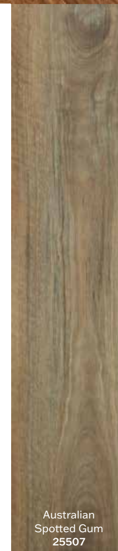
Australian Spotted Gum 25507